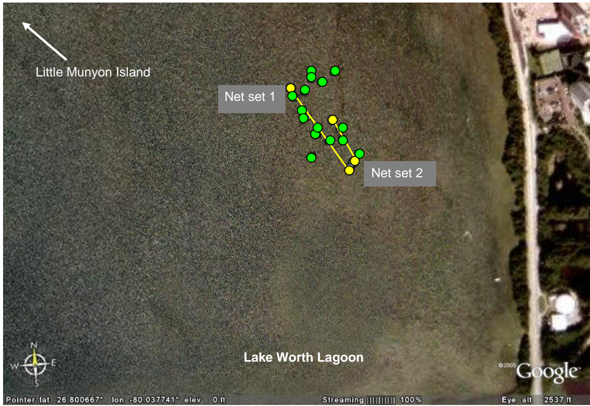
Figure 3. Net set locations, captures and non-transect sightings on June 15, 2005. Green dots = Chelonia mydas , yellow line = net.