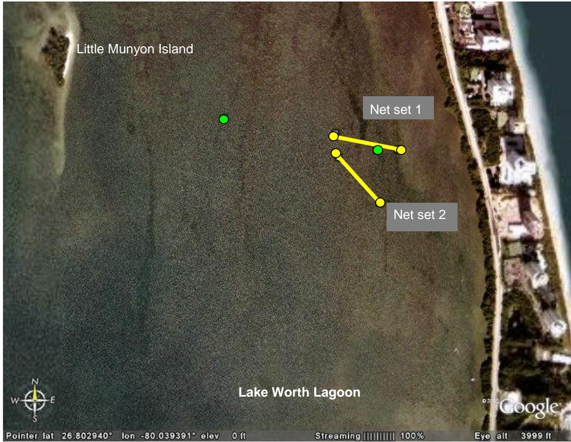
Figure 2. Net set locations, captures and non-transect sightings on June 14, 2005. Green dots = Chelonia mydas , yellow line = net.