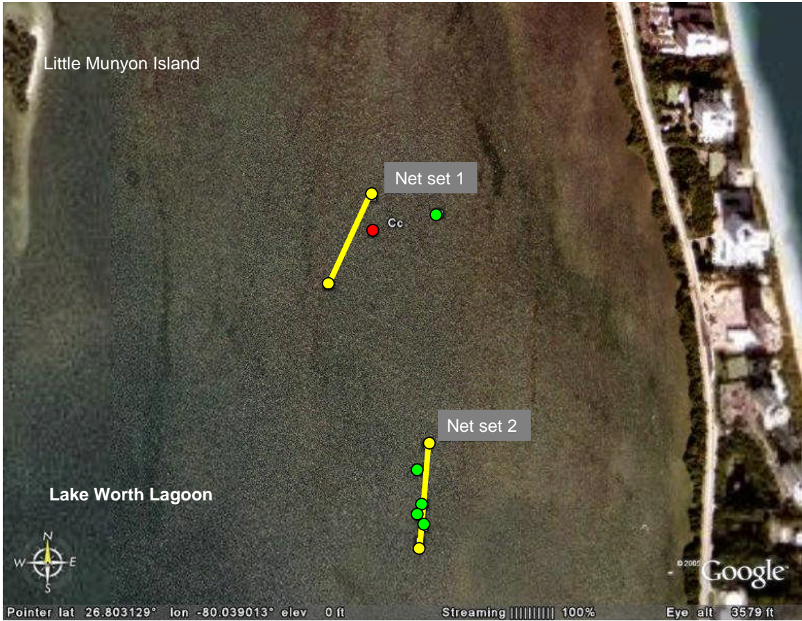
Figure 1. Net set locations, captures and non-transect sightings on June 13, 2005. Green dots = Chelonia mydas , Red dot = Caretta caretta , yellow line = net.