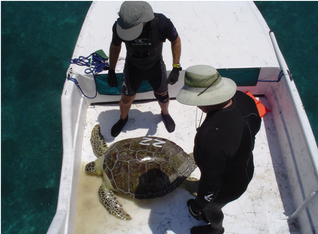
Large green turtle ( Chelonia mydas ) prior to release, west of the Marquesas Keys.