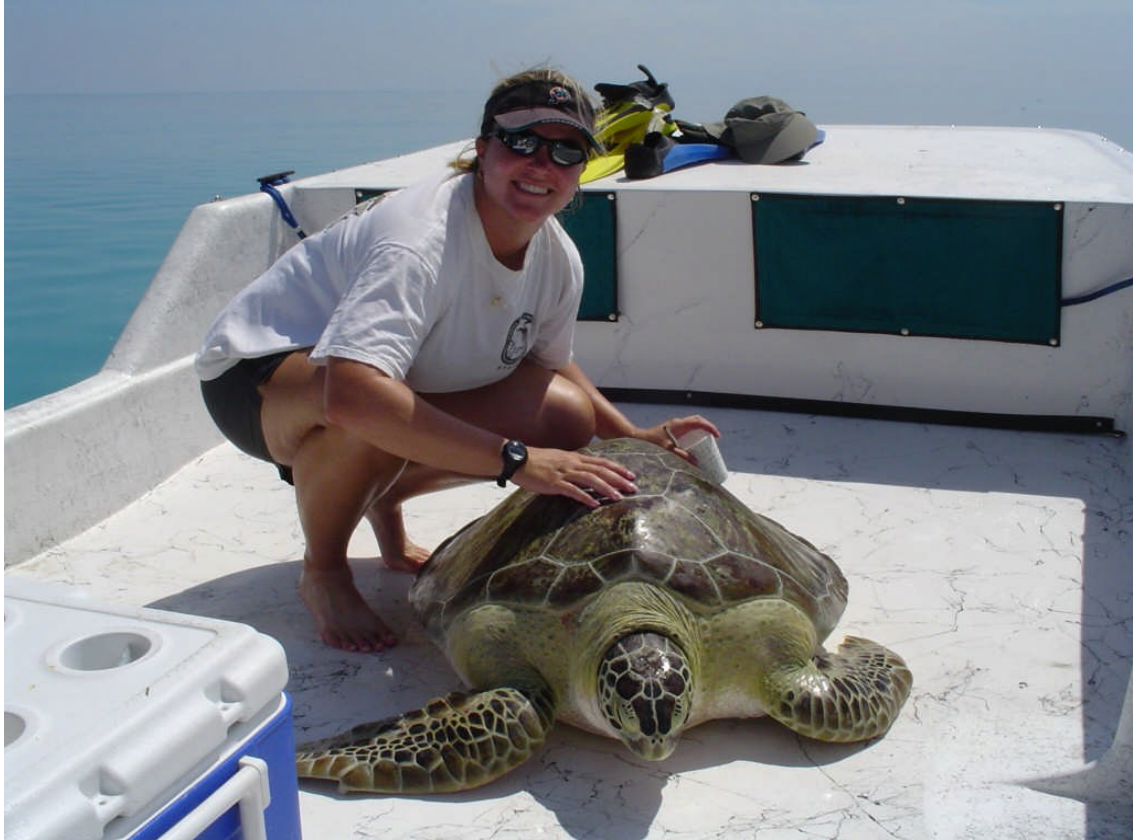
Large green turtle ( Chelonia mydas ) captured west of the Marquesas Keys.