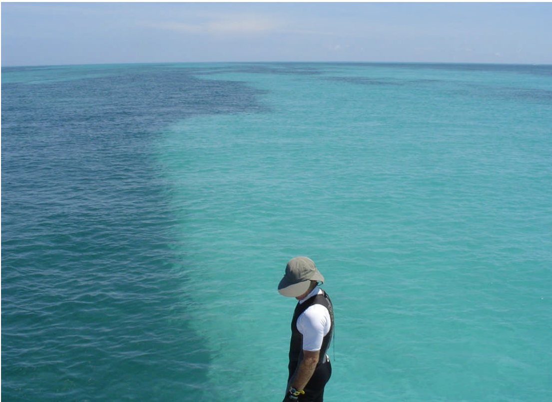
Six kilometers west of the Marquesas Keys where large green turtles were captured.