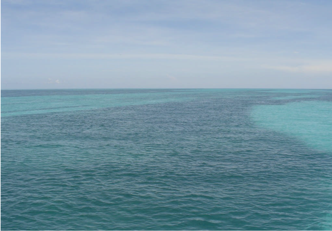
Syringodium and sand habitat west of the Marquesas Keys, Florida