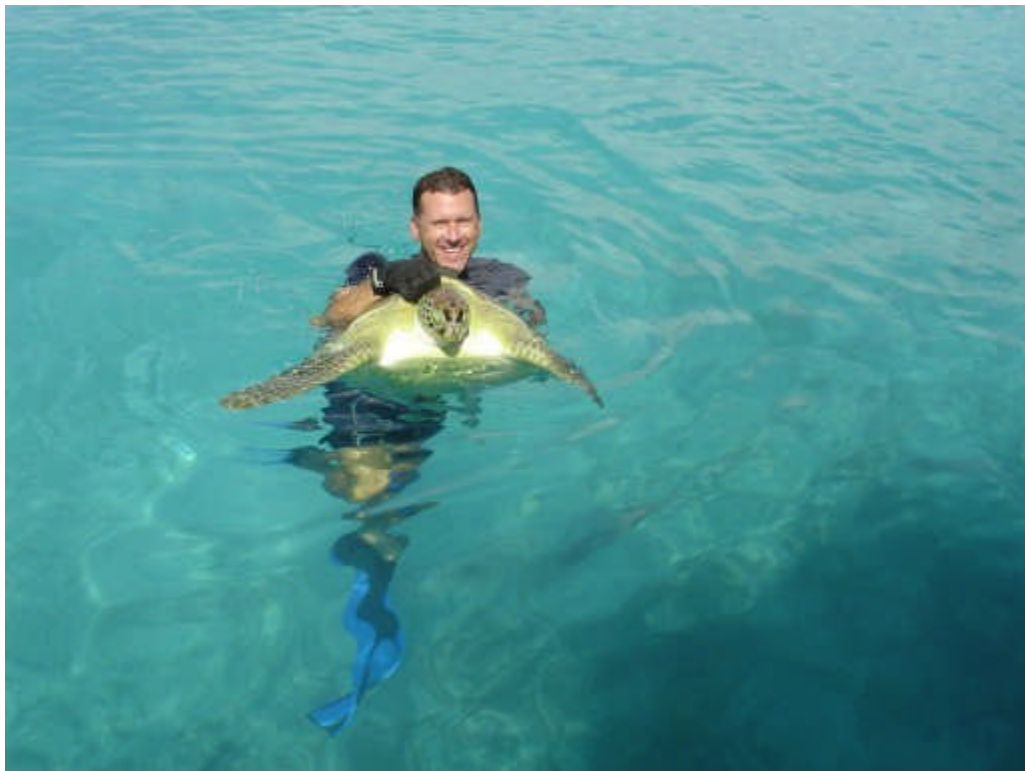
Hand capture of a green turtle ( Chelonia mydas ) west of the Marquesas Keys.