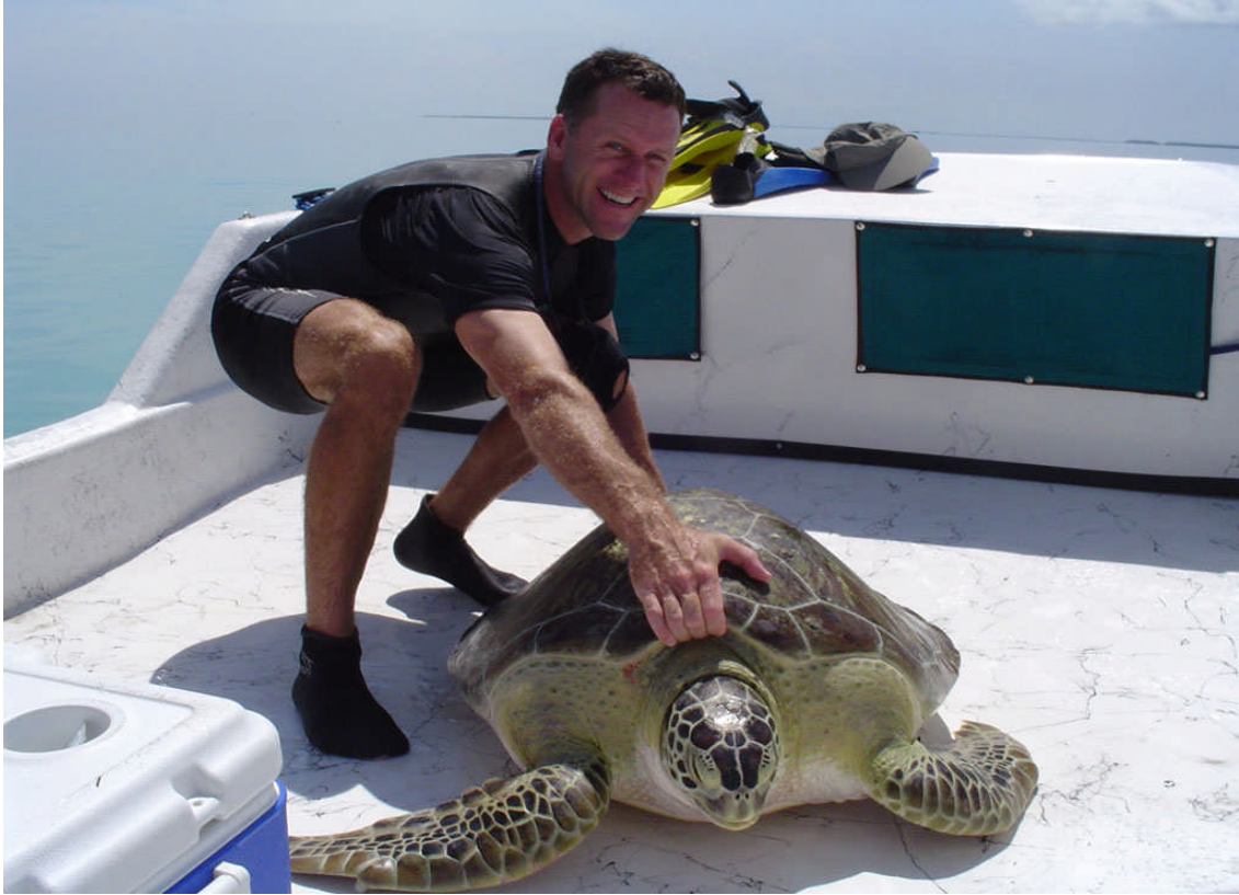
Green turtle ( Chelonia mydas ) captured west of the Marquesas Keys.